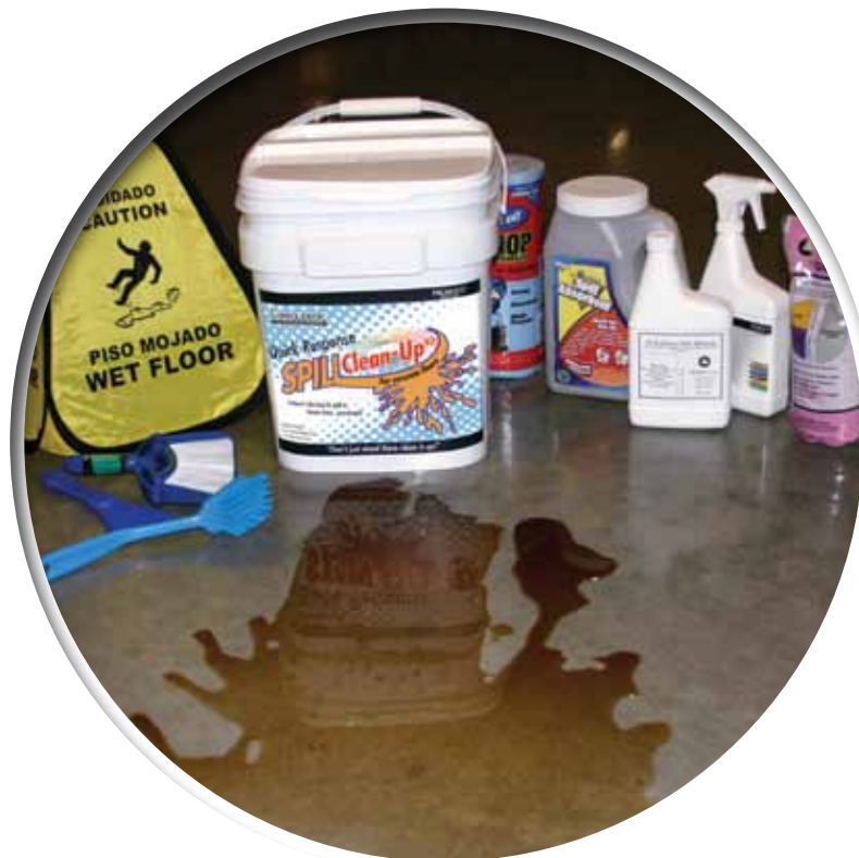
The Consolideck® Quick Response Spill Clean-Up kit for concrete floors has the basic tools, instructions and materials for cleaning most spills before they cause stains.

Never use acidic or alkaline cleaners on Consolideck® floors.