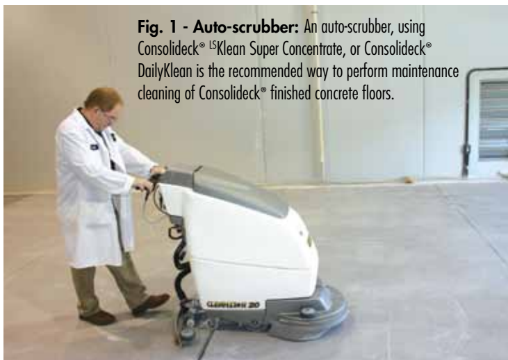
Fig. 1 - Auto-scrubber: An auto-scrubber, using Consolideck® LS Klean Super Concentrate, or Consolideck® DailyKlean is the recommended way to perform maintenance cleaning of Consolideck® finished concrete floors.