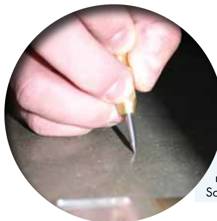
Fig. 4 - Hardness test: Here, a hardness pick is used to test the hardness of a honed performance floor, as measured on the Mohs Scale.