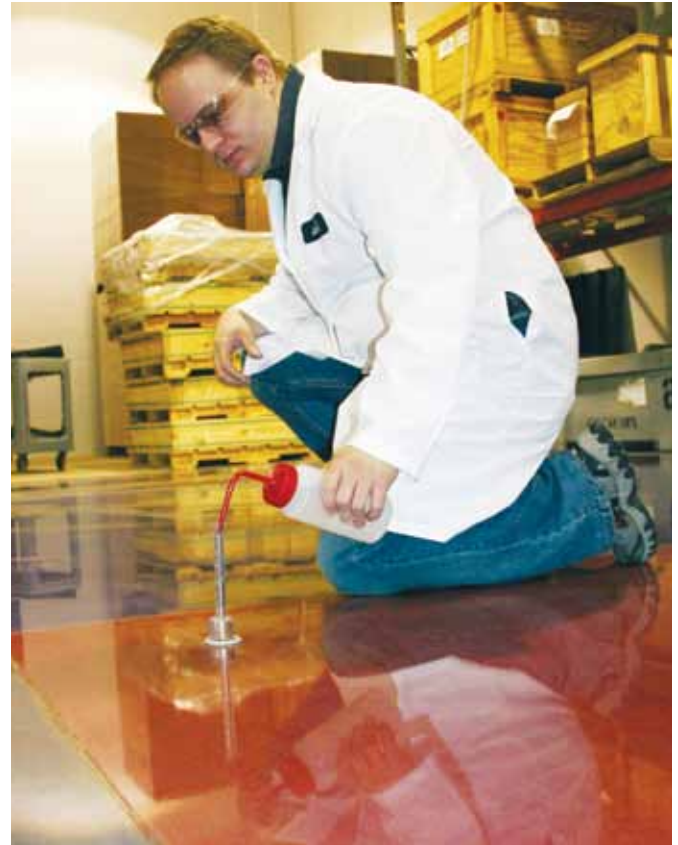
Fig. 3 - Rilem Tube Test: Consolideck® professionals are trained in the use of standardized performance tests. Here, a technician uses the kit's Rilem Tube to check the water-resistance of a Consolideck® Decorative Performance Floor.

Consolideck® professionals are fully trained in the use of the following performance tests: gloss meter, hardness pick set, and Rilem tube.